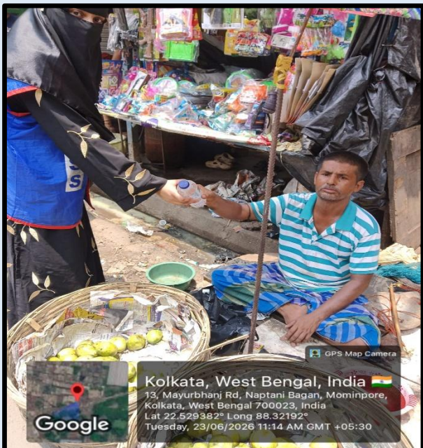
Kolkata, West Bengal, India 13, Mayurbhanj Rd, Naptani Bagan, Mominpore, Kolkata, West Bengal 700023, India Lat 22.529382° Long 88.32192° Tuesday, 23/06/2026 11:14 AM GMT +05:30