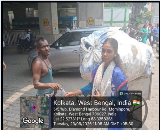
Kolkata, West Bengal, India 5/5/h/b, Diamond Harbour Rd, Mominpore, Kolkata, West Bengal 700027, India Lat 22.527311° Long 88.325836° Tuesday, 23/06/2026 11:08 AM GMT +05:30