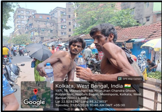
Kolkata, West Bengal, India 13/h, 18, Mayurbhanj Rd, Near Jnan Chandra Ghosh Polytechnic, Naptani Bagan, Mominpore, Kolkata, West Bengal 700023, India Lat 22.529236° Long 88.321803° Tuesday, 23/06/2026 10:46 AM GMT +05:30