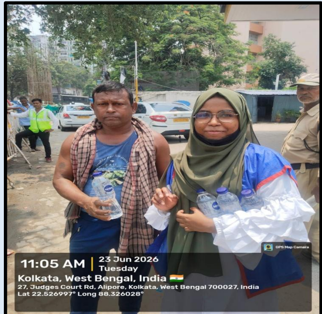
11:05 AM | 23 Jun 2026 Tuesday Kolkata, West Bengal, India 27, Judges Court Rd, Alipore, Kolkata, West Bengal 700027, India Lat 22.526997° Long 88.326028°