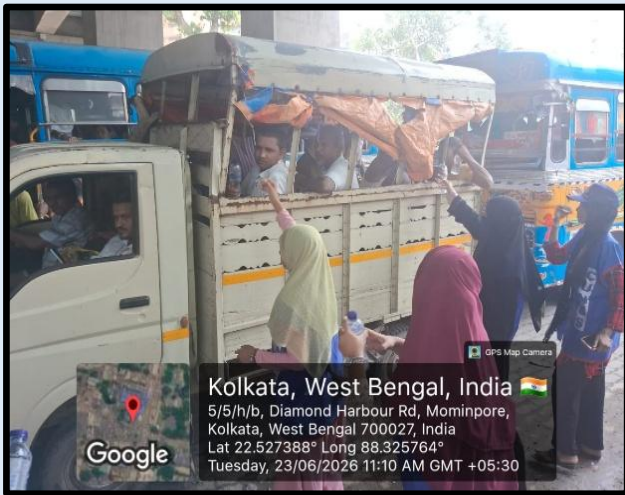
Kolkata, West Bengal, India 5/5/h/b, Diamond Harbour Rd, Mominpore, Kolkata, West Bengal 700027, India Lat 22.527388° Long 88.325764° Tuesday, 23/06/2026 11:10 AM GMT +05:30