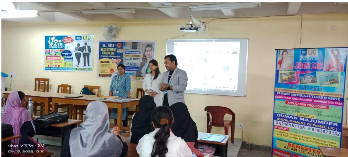
vivo Y33s · SM Dec 13, 2025, 13:31