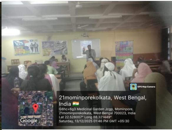
21mominporekolkata, West Bengal, India 🇮🇳 G8hc+6g3 Medicinal Garden Jcgp, Mominpore, 21mominporekolkata, West Bengal 700023, India Lat 22.528007° Long 88.321449° Saturday, 13/12/2025 01:46 PM GMT +05:30